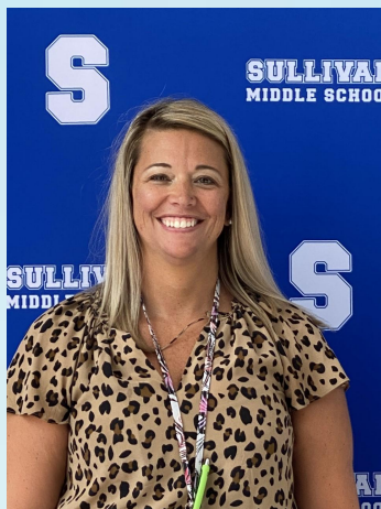
IB Coordinator/ Instructional Coach